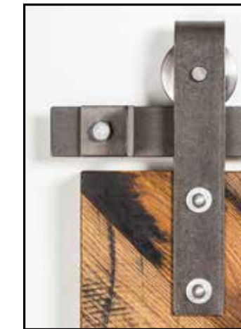
Standard Steel Wheel

Wheels Standard Low Profile Aluminum Spoke