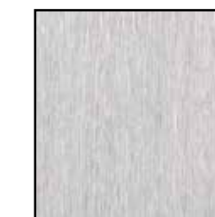
Brushed Stainless Steel