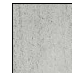
Milled Stainless Steel